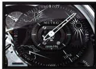
Above: Brevia Génie 01, white gold.